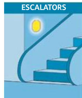
ESCALATORS Should not be used as an escape route, but requires the same illumination to protect users on it when the supply fails.