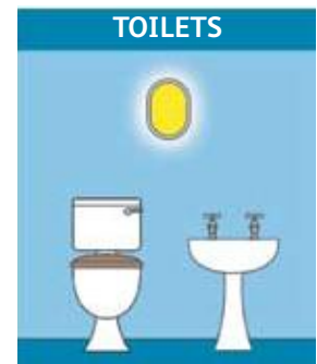
TOILETS Install in all toilets exceeding 8m 2 area or where natural light is not present.