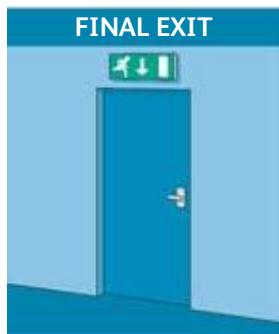
FINAL EXIT To provide illumination of escape routes.