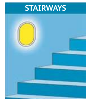
STAIRWAYS Install within 2 metres horizontal distance of a change in floor level of stairs (each tread to receive direct light).