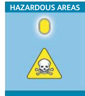
HAZARDOUS AREAS Areas of high risk should be illuminated to 10% of normal lighting or 15 lux, whichever is greater.