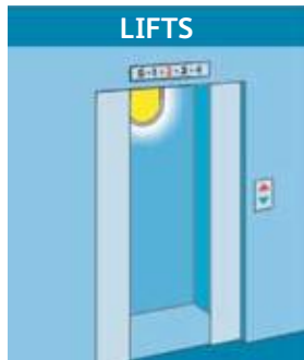
LIFTS To provide emergency illuminations in all lifts.