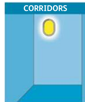
CORRIDORS Install within 2 metres horizontal distance of a change of direction in an escape route.