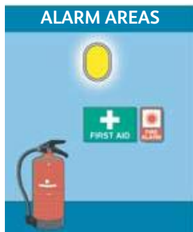
ALARM AREAS Fire extinguishers, first aid points and fire-lighting equipment, install within 2 metres horizontal distance.