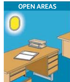
OPEN AREAS Open rooms either with a particular hazard, an escape route passing through or larger than 60m 2 .