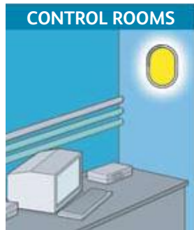
CONTROL ROOMS Motor generator, control and plant rooms for essential and safety services.